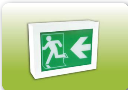
"CRISTALITE" Cat. CX-LED-220-B-MG