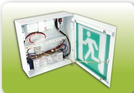
"CRISTALITE" Cat. CX-LED-165-B-MG